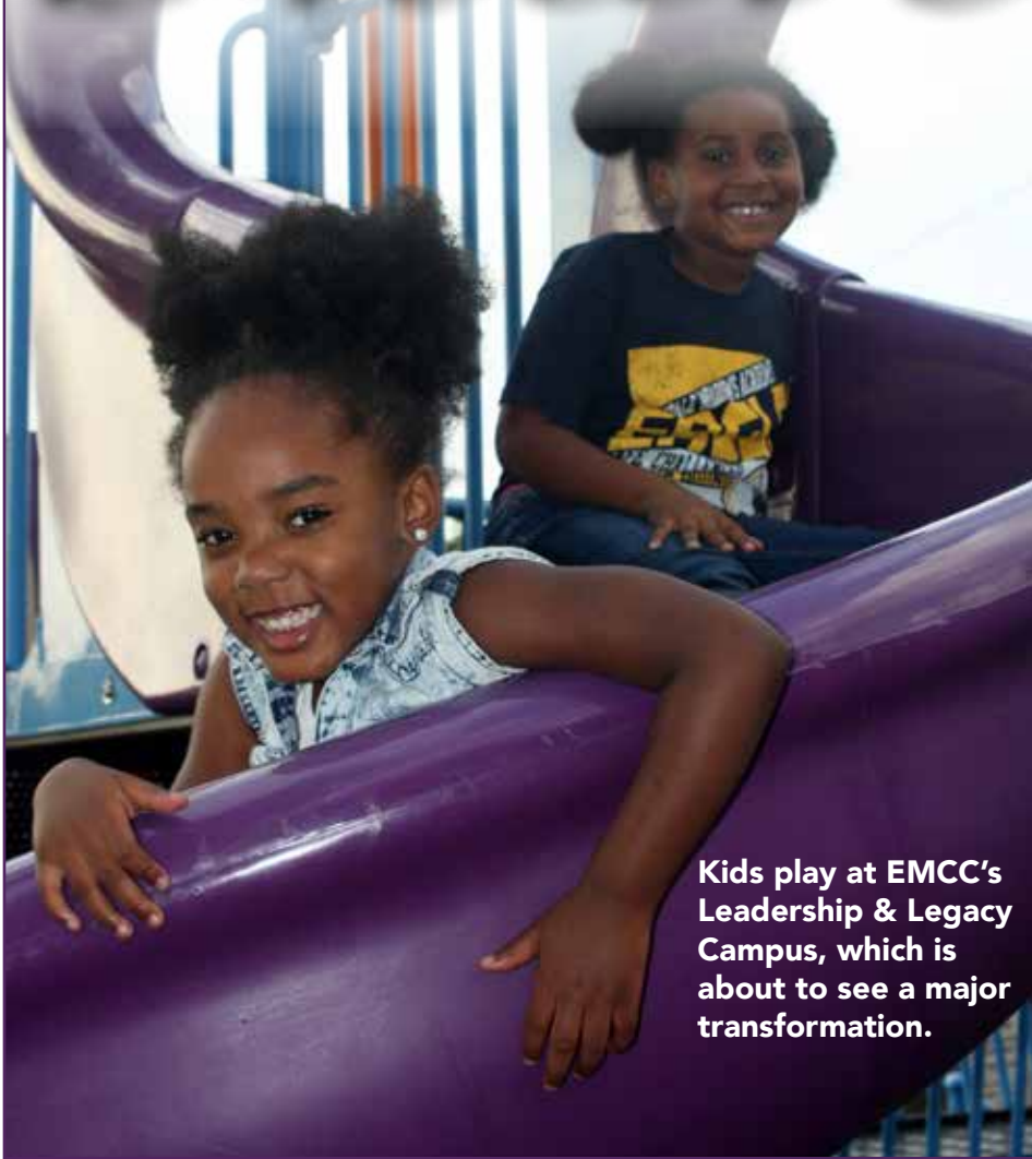
Kids play at EMCC's Leadership & Legacy Campus, which is about to see a major transformation.

There are changes coming to the 24,000 square-foot complex on Ralston Avenue, and we want you to be a part of the biggest story Martindale-Brightwood has seen in fifty years.