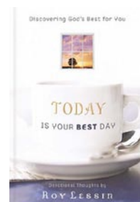
Today is Your Best Day: Discovering God's Best for You, by Roy Lessin